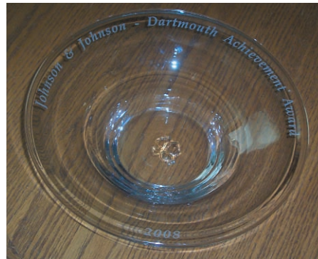
Johnson & Johnson – Dartmouth Achievement Award

health agency's supported employment program and local Vocational Rehabilitation office. $10,000 was given to each supported employment program.